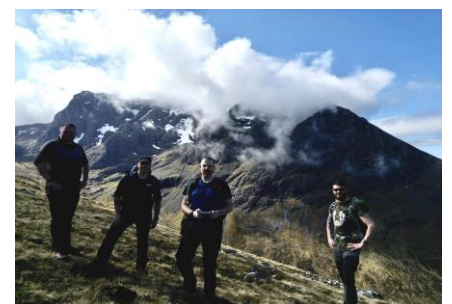
Regular walks in the Scottish Mountains.