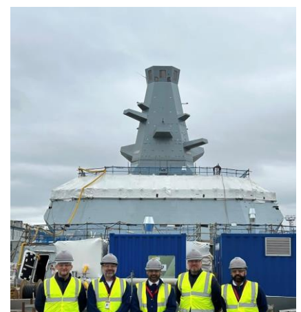
SABS visit to HMS GLASGOW in Scotstoun

HMS GLASGOW’s Ship’s Company hosted a visit by members of the Scottish Ahlul Bayt Society (SABS) in May. The Society is a faith-based organisation working to meet the needs of the Scottish Shia Muslim community and the breadth of society in general across the cultural, social, political, and religious spectra.