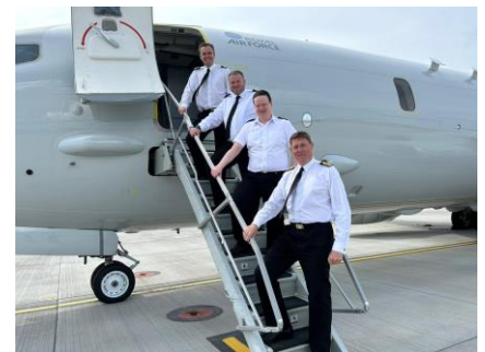
HMS GLASGOW's Crew visit a P8-A Poseidon.

Bonding over the challenges of integrating a new military asset into service, both CXX Squadron and HMS Glasgow shared interesting parallels starting units from humble origins as small teams. Although both organisations are capable of conducting an array of maritime tasks, they share a primary purpose, to hunt and deny hostile submarine activity.