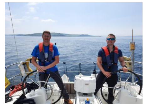
Taking the opportunity to sail on the Clyde.